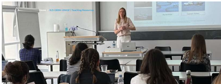
ILO-GBSN-UNIGE | Teaching Resources

Integrating human rights in teaching | Teaching resources